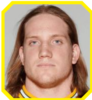
A.J. Hawk is quickly becoming one of the NFC's best linebackers.

As a rookie last year, Hawk led Green Bay in tackles with 121, including 84 solo stops. He also added 3.5 sacks; two interceptions and a forced fumble while starting all 16 games for the Pack-