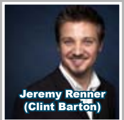
Jeremy Renner (Clint Barton)