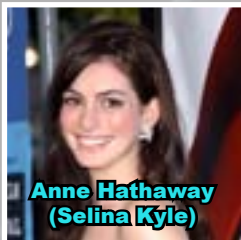
Anne Hathaway (Selina Kyle)