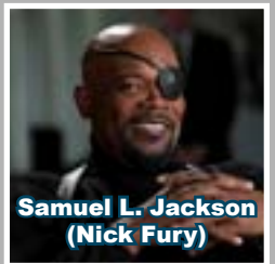
Samuel L. Jackson (Nick Fury)