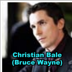
Christian Bale (Bruce Wayne)