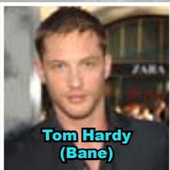
Tom Hardy (Bane)