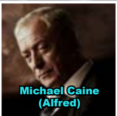
Michael Caine (Alfred)