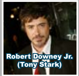
Robert Downey Jr. (Tony Stark)