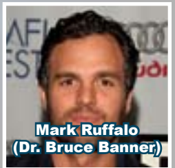
Mark Ruffalo (Dr. Bruce Banner)