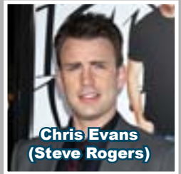
Chris Evans (Steve Rogers)