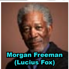
Morgan Freeman (Lucius Fox)