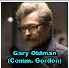
Gary Oldman (Comm. Gordon)