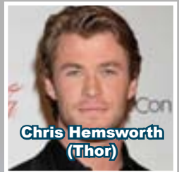
Chris Hemsworth (Thor)