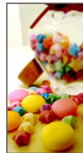
COLOR SPILL BY: MEESHELLE