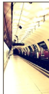
LONDON VXII BY: *VANERICH