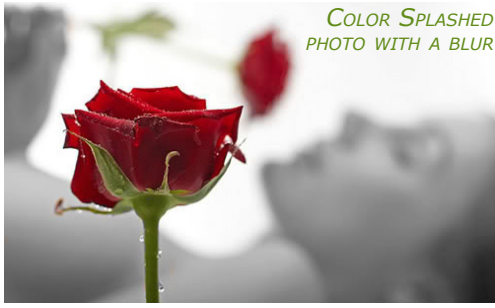
COLOR SPLASHED PHOTO WITH A BLUR

black and white photo to stand out. A good example of a color splashed is shown above, in which everything in the photo is black and white, while the roses in the photo remain colored. Another good technique the photo editor of this picture used is using a background blur.