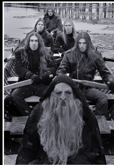
(Kalmah group photo) Before Kalmah had begun they were called Ancestor, but after disbanding it the new group became known as Kalmah. From 1991- Present

Kalmah probably is one of the best melodic death metal bands out their because they have't changed their style as much as others like "In flames." Yet they still keep their music fresh and new everytime. Also the band actually uses death metal sounds and riffs. Most bands just make their songs sound melodic and not melodic death metal. Kinda making a new genre maybe we can call it Melodic Metal instead. Kalmah may not be a underground band like many want it but it still hasn't gone mainstream.