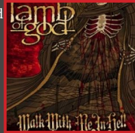
Walk With Me in Hell-2008