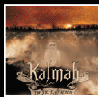
For The Revolution-2008