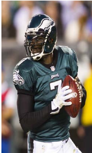
QB Michael Vick