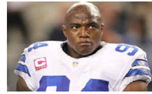
LB DeMarcus Ware