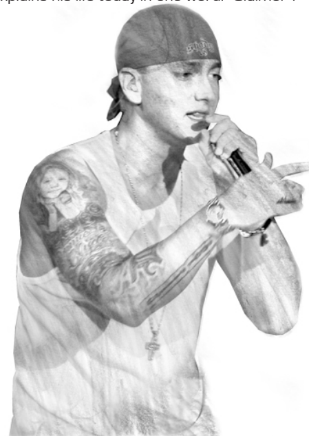
Eminem is the most successful white rapper ever.