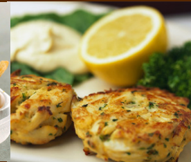
Sauteed Jumbo Lump Crab Cakes