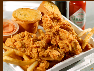
Fried Chicken Tenders