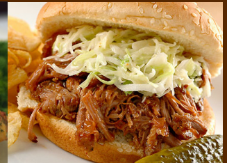
Smoked BBQ Pulled Pork