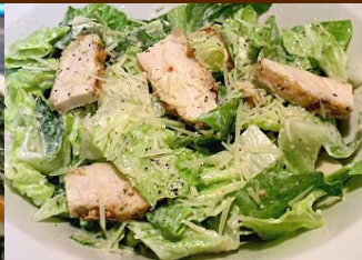
Traditional Caesar Salad