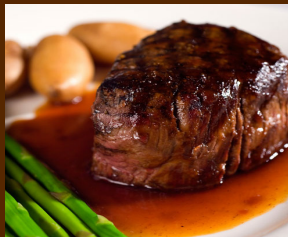
Grilled Filet Mignon