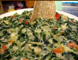
Hot Spinach, Parmesan & Artichoke Dip