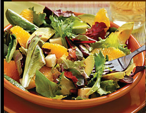
Chop House Salad