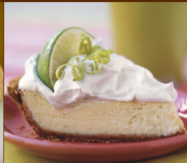
Key Lime Pie