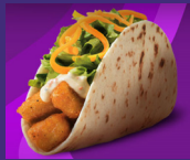
Crispy Potato Soft Taco

A warm, soft flour tortilla filled with crispy potato bites, pepper jack sauce, tomato, crisp lettuce, and shredded Mexican cheese.