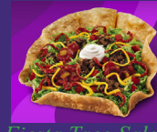
Fiesta Taco Salad

A crispy tortilla bowl filled with seasoned ground beef, seasoned rice, real cheddar cheese, hearty beans, lettuce, tomatoes, red tortilla strips and sour cream. Chunky salsa served on the side.