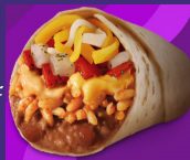
Cheesy Bean & Rice Burrito

A warm flour tortilla loaded with hearty beans, seasoned rice, a blend of three cheeses – cheddar, pepper jack and mozzarella – nacho cheese sauce, Jalapeño sauce, and Fiesta Salsa.