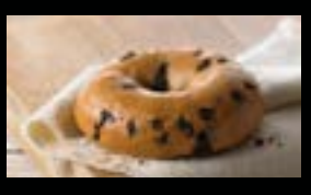
Chocolate Chip Bagel