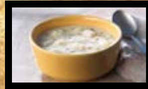
Baked Potato Soup