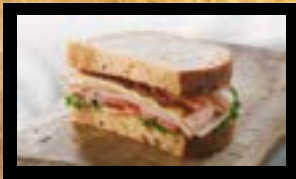
Bacon Turkey Sandwich