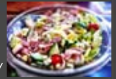
The Wreck Salad

All salads are made to order and served on fresh lettuce and your choice of dressing. Dressings include buttermilk ranch, creamy vinaigrette, roasted garlic vinaigrette, and non-fat vinaigrette.