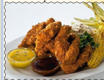
Cajun Chicken Littles

Boneless Breast of Chicken Pieces, Spiced, Breaded and Fried Crisp Served With Mashed Potatoes and Corn on the Cob