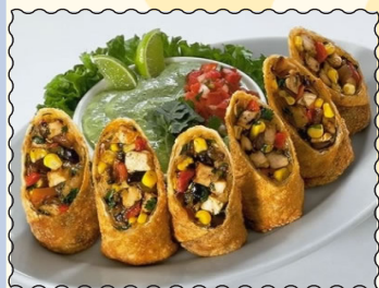
Tex Mex Eggrolls

Spicy Chicken, Corn, Black Beans, Peppers, Onions and Melted Cheese. Served with Avocado Cream and Salsa