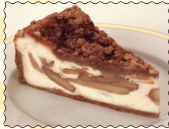
Dutch Apple Caramel Streusel