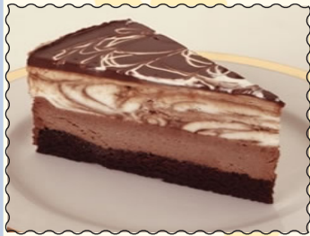
Chocolate Tuxedo Cheesecake

Layers of our Fudge Cake, Chocolate Cheesecake, Vanilla Mascarpone Mousse and Chocolate